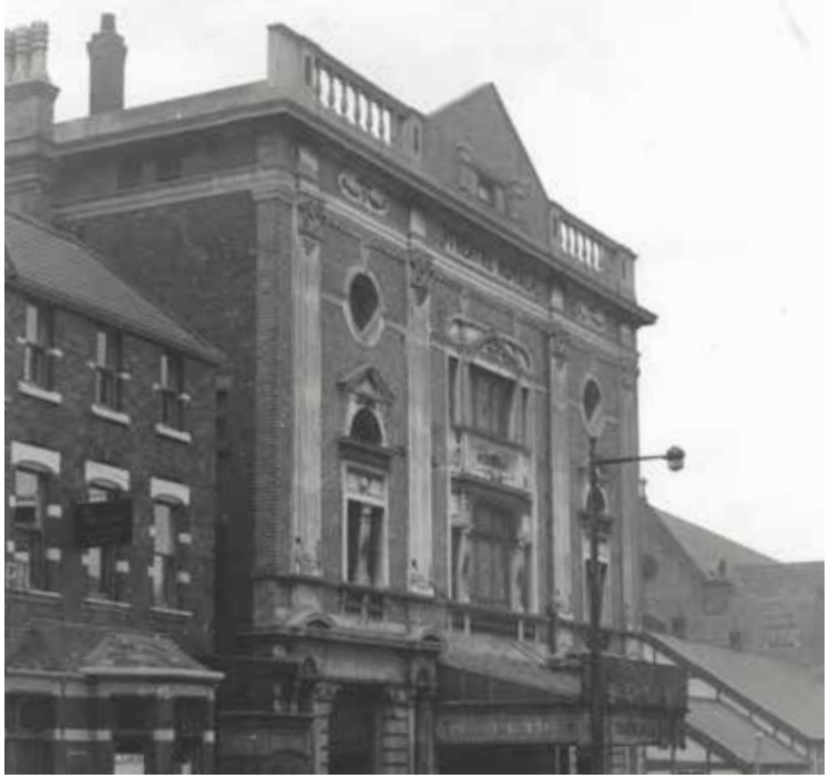
ABOVE AND RIGHT The theatre as it looked in the early 1960s... ...And as it is today

library with a new regular feature devoted to images of the borough's past. We start with one of the town centre's most familiar landmarks – the Theatre Royal.